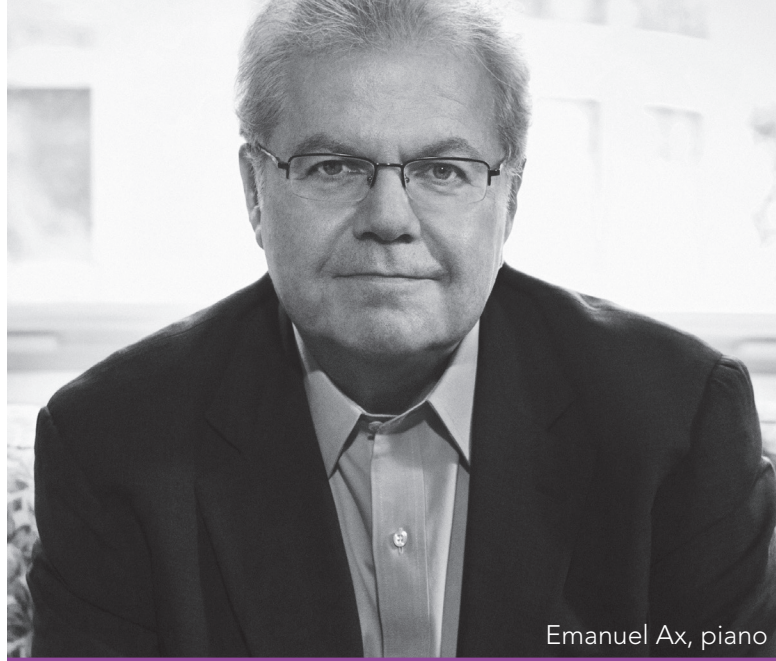
Emanuel Ax, piano